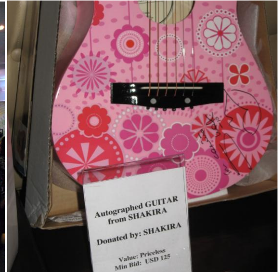
Display of more than 50 Silent spectacular Auction Items donated by our Sponsors at the Night for Smiles 2010. Right. Autographed guitar by Shakira.