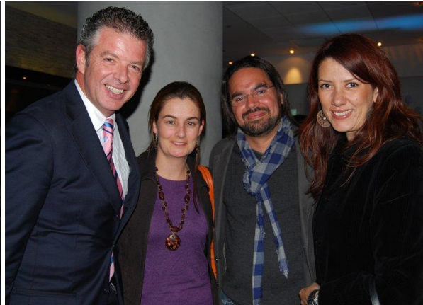
Friends of Smiles Foundation enjoying an evening of wine tasting and music at Zucchero Restaurant.