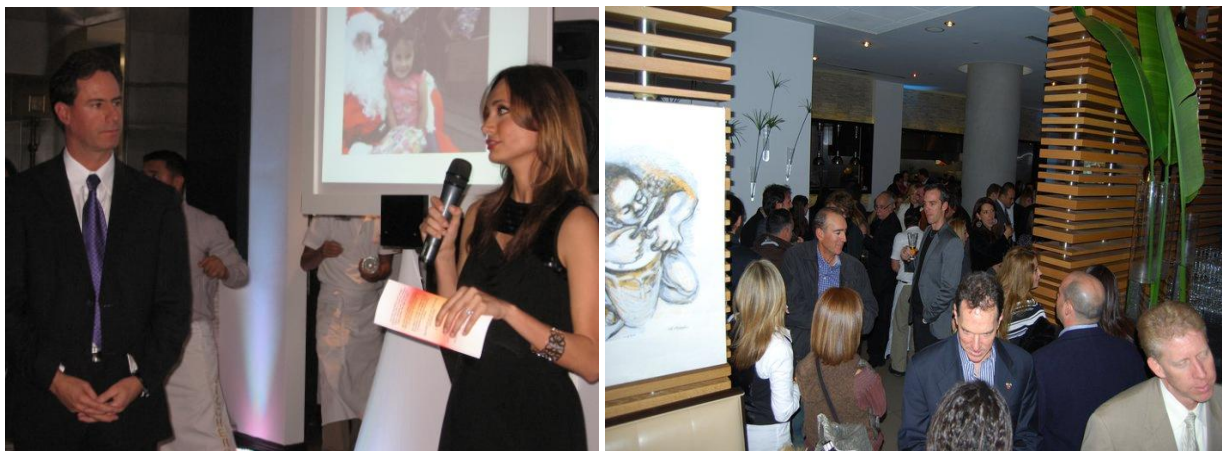
A few words about the projects executed last year by Smiles Foundation in South America.