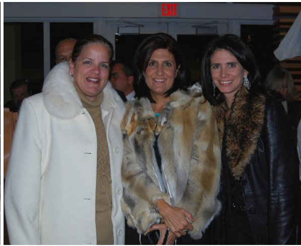
Friends of Smiles Foundation enjoying an evening of wine tasting and music at Zucchero Restaurant.