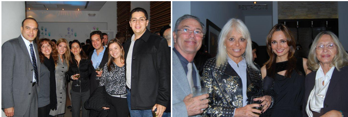
Friends of Smiles Foundation having fun at The Night for Smiles 2010 Event.